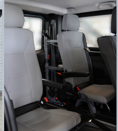
Optional tip & fold seats allow flexible use of the vehicle.