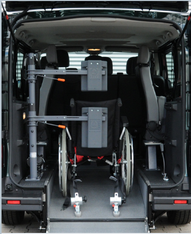
Optional the vehicle can be equipped with the head & backrest FUTURESAFE.