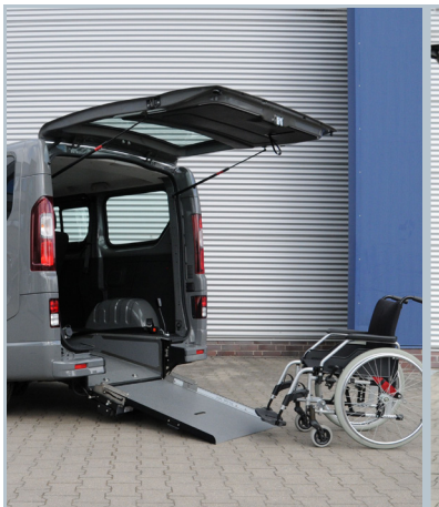
With the unfolded ramp the vehicle can be accessed comfortably with a wheelchair.