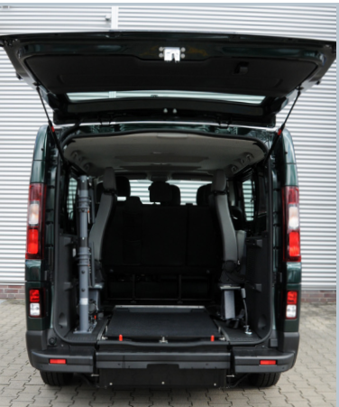
With the optional EASY FLEX ramp folded down the luggage compartment is fully usable.