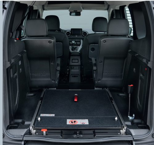
Optional EASYFLEX ramp folded flat allows full use of the luggage area.