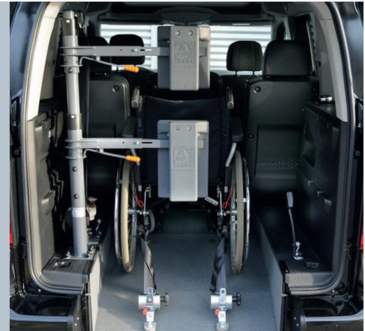
Optional the vehicle can be equipped with the head & backrest FUTURESAFE .