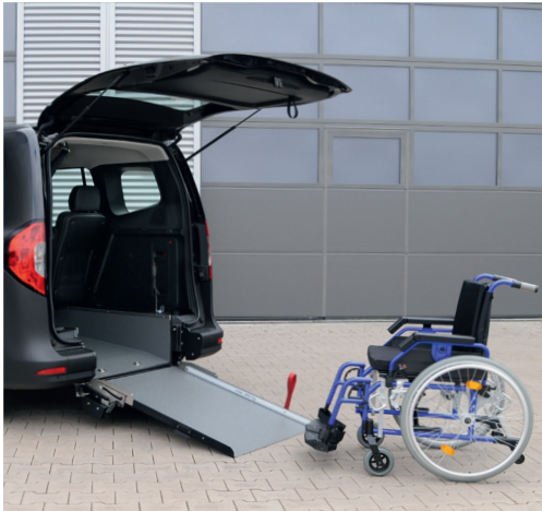
With the unfolded ramp the vehicle can be accessed comfortably with a wheelchair.