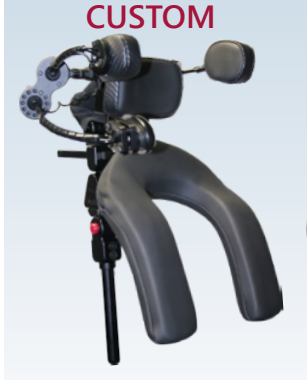
Customized i-Drive with Ultra Channel & i2i Pad