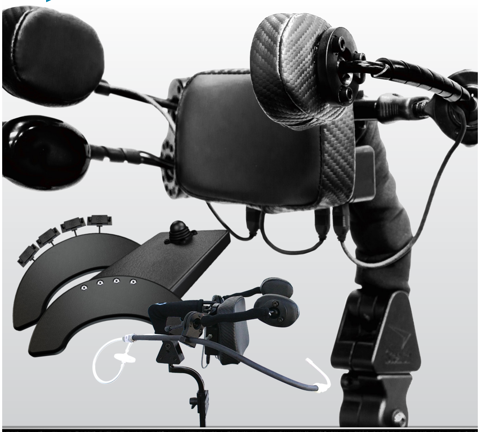
i-Position • i-Set • i-Drive