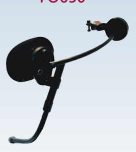
Lateral Rod Fiber Optic Mount cable included