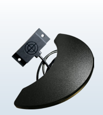
IDT100-1 Eclipse Tray with 4 Capacitive Proximity Sensors