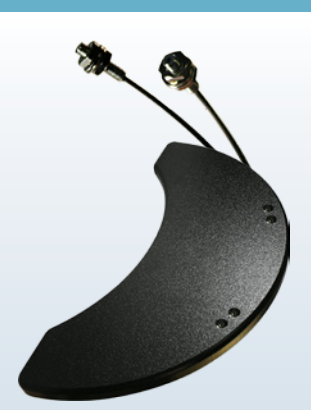
IDTF100-1 Eclipse Tray with 4 Fiber Optics Proximity Sensors