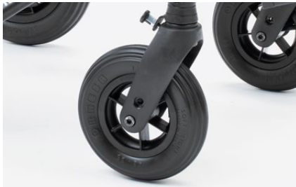
812 Front wheel directional locks