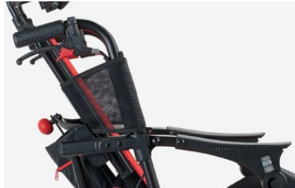
844 Padded side protection covers