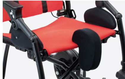
834N Padded abduction block removable. Available in two sizes.