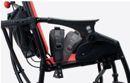
947 Pelvic belt with variable angle Available in two sizes.