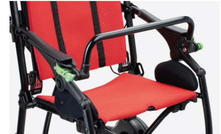
839 Front handlebar Adjustable in tilt. Easy to remove to fold the stroller.