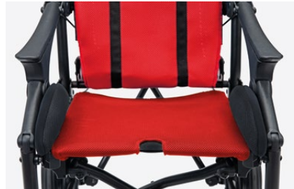
958 Padded pelvic side supports