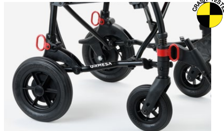
891 Set of 4 tie down hooks for the forward-facing transport of the pushchair in a motor vehicle (private/cars, buses..). See User and Maintenance Manual provided with the aid.

It increases the total height of max. 7 cm/2,7 in (94-101 cm/37-39,7 in)