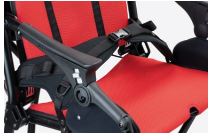
920 Four point pelvic belt Available in two sizes.