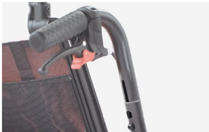
951 Height adjustable push handles

It increases the total height of max. 7 cm/2,7 in (94-101 cm/37-39,7 in)