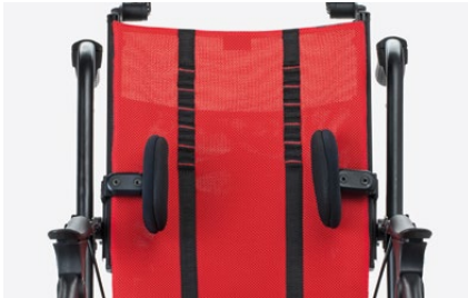
838 Trunk side supports adjustable in height, width and rotation. Available in two sizes.