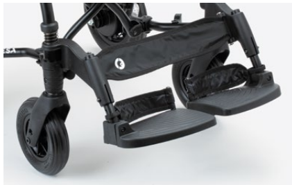
960 Heel rests