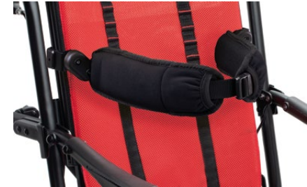
868 Wrappable and flexible trunk supports Adjustable in height, width and transversally.