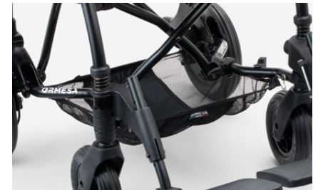
858 Shopping basket