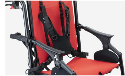
853 Vest harness