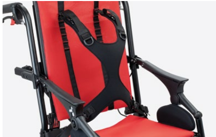
853 slim Four point shaped harness