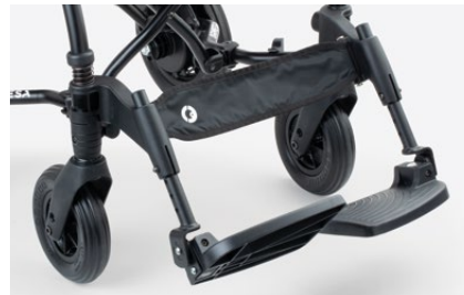
956 Footrests adjustable in tilt