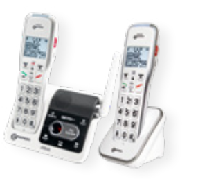
AMPLIDECT595 U.L.E DUO