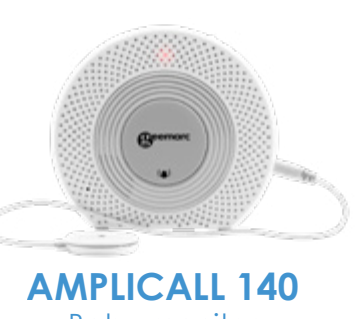
Baby monitor + sound sensor