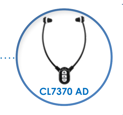
Compatible with the entire CL7370 range