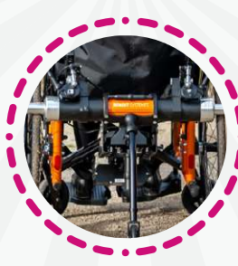
Extended colour range