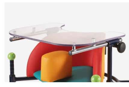
824 Transparent tray With circular recess. Adjustable in depth.