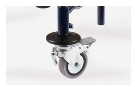
812 Directional locks Help the direction of the walking frame.