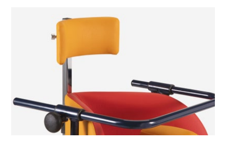
860 Concave headrest Adjustable in height.