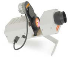
Solar 100 LED Projector

A projector set offers a range of colour & picture wheel options, instantly creating delightful effects & colourful, imaginary worlds in subdued lighting. The projector can be directed through the netting roof or a viewing panel of the Safespace or against a wall, where it can be enjoyed, while the equipment remains safely out of harm's way.