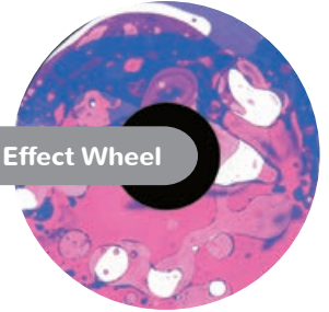
Liquid Effect Wheel

We now have an extensive choice of effects and picture wheels available. Contact us to discuss options.