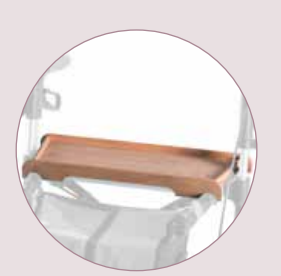
Real wood tray