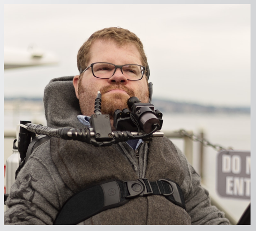
Mount the Tri-Lock vertically to put the Midline Arm over the shoulder for chin and mouth-controlled systems.