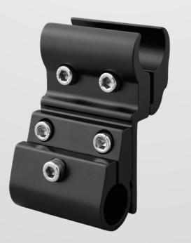
PC011 Tube Mount Fits Invacare Ø22 mm, 7/8" round-tube armrests