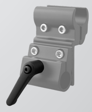
FA171 Quick-Release Lever For easy adjustment and removal of the Tri-Lock<sup>™</sup> Rotating Shaft

The optional Quick-Release Lever attaches to the Mounting Clamp to allow easy adjustment and removal of the Tri-Lock<sup>™</sup> Rotating Shaft.