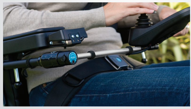
Mount the Tri-Lock Rotating Shaft horizontally to place hand-controlled joysticks in front of the body at midline or anywhere along the shaft to meet individual needs.