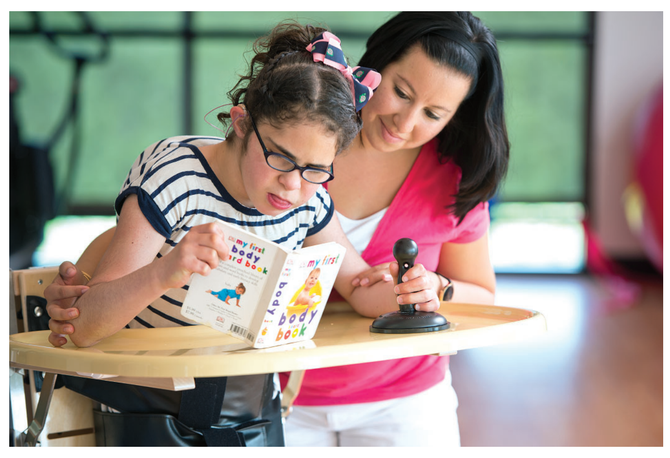
Supported by the hand Anchor, this child is able to participate in activities she enjoys.