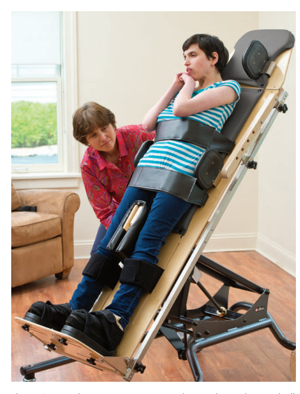
The Supine Stander stays secure at any angle. Turn the crank to gradually increase weight-bearing.