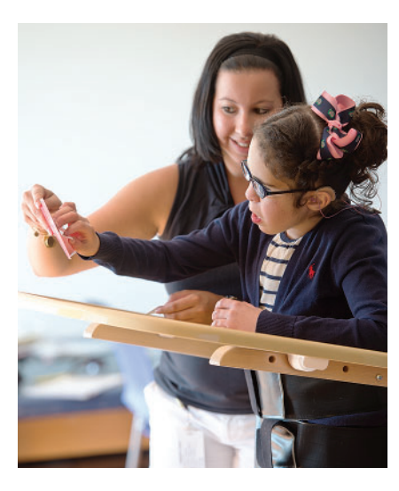
Once upright, the client is on the same level with caregivers and peers and can interact with her environment.