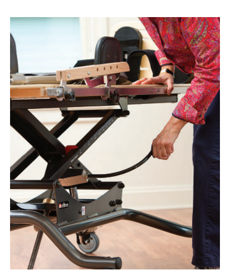
Use the frame's marked calibrations to record and maintain each client's optimal position.