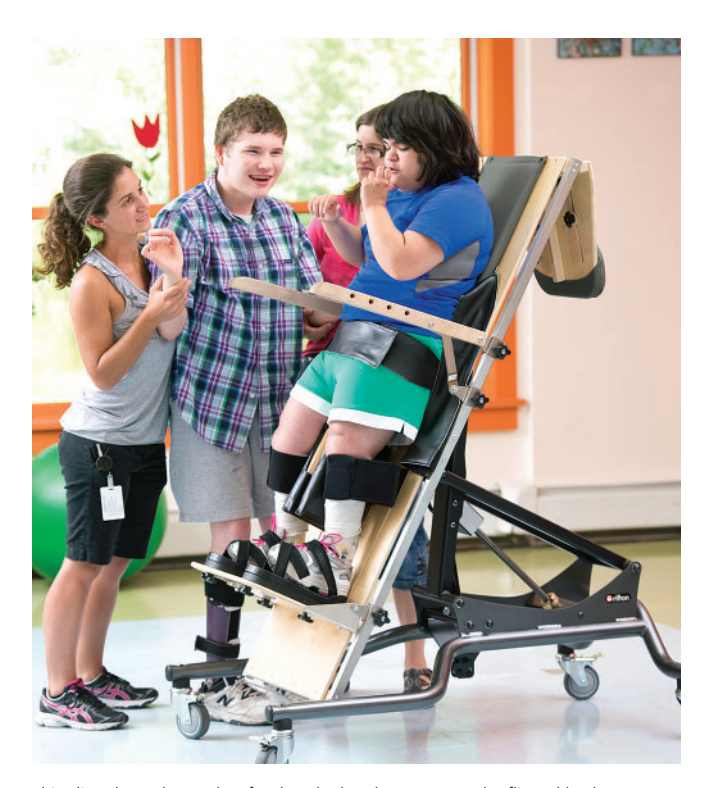
This client has advanced so far that the headrest can now be flipped back out of the way.