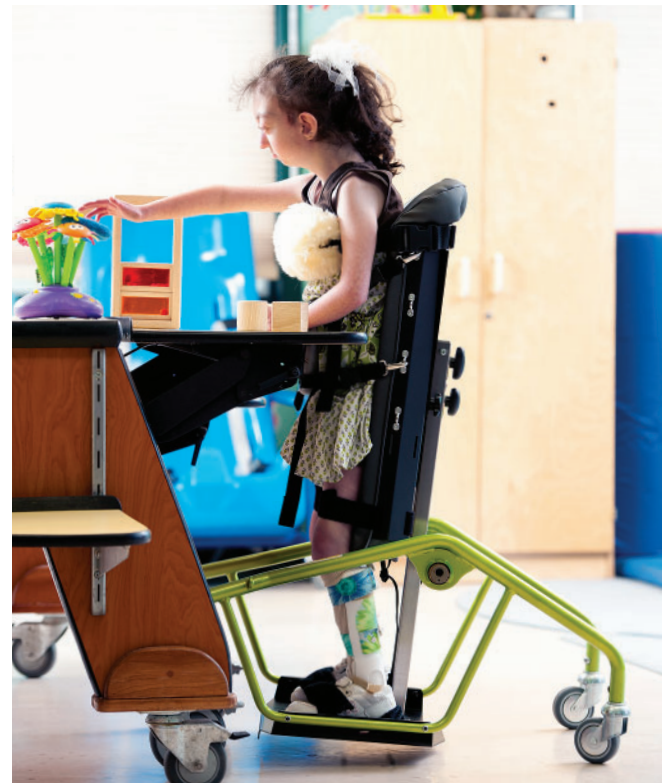
When Carolyn can actively extend her hips and knees to bear her own weight, she is placed in the reverse position. This allows free arm movement as her standing ability develops.