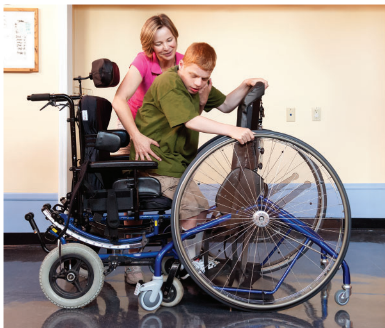
The wide, accessible deck makes transfers easy.