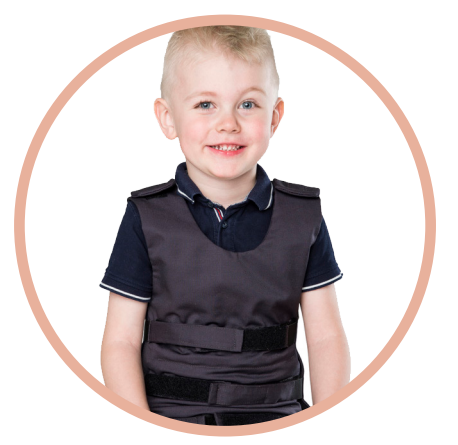
Somna Weighted Vest