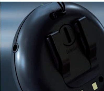
Reverse side of the pocket receiver with balance adjustment (featured on both receiver types), belt clip and eyelet for a carrying cord