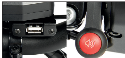
Horn and USB port.