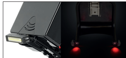
100-lumen front light with running lamp/high beams. Dual LED tail light on the stand frame.