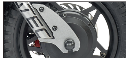
Removable right dropout to change inner tube and/or tyre easily.