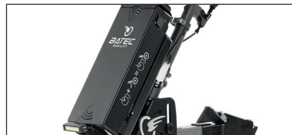
28-km autonomy with 36 V – 280 Wh battery. 52-km autonomy with 36 V – 522 Wh battery. 4A charger.