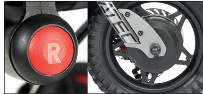
Brushless motor, 350 W nominal, 600 W maximum. Top speed of 20 km/h.