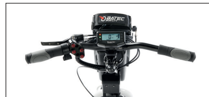
Monolever brake and accelerator handlebar for hemiplegics.