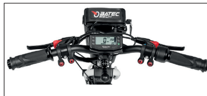
Matte black aluminium handlebar.