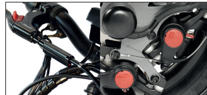
Avid BB5 mechanical brakes. Avid G2 140 mm rotor disc. Parking brake.