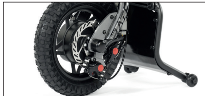
12" wheel with 12" x 2.40" ultra-grip tyre and black cast-aluminium rim.