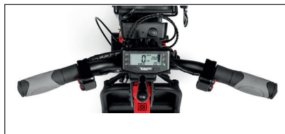
Optional G&B handlebar without levers for quadriplegics.