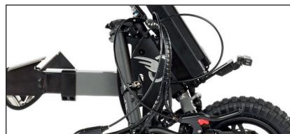
Folding system for transport. Frame adjustable in 3 directions, to fit any user.