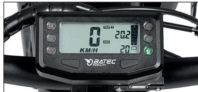
All-in-one LCD screen with speed selector.