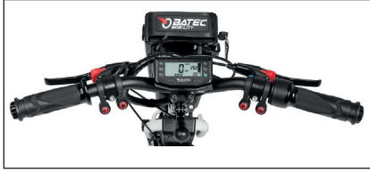
Matte black aluminium handlebar with folding system for convenience.