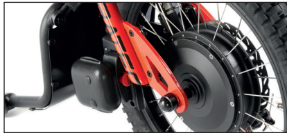
Removable right dropout for easy inner tube or tyre change.