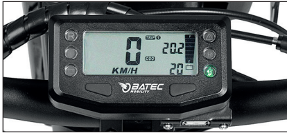
All-in-one LCD screen with gear selector.