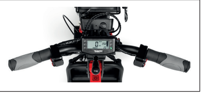
G&B handlebar option without levers for quadriplegics.