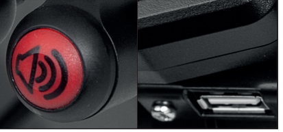
Horn and USB port.