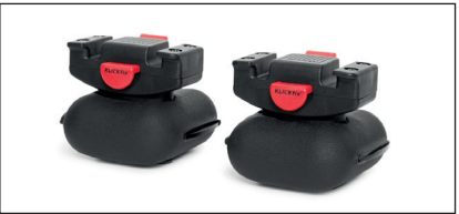
Removable QR weights.