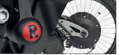
250 RPM 900W high torque brushless motor with reverse gear. Maximum speed 25 Km/h.