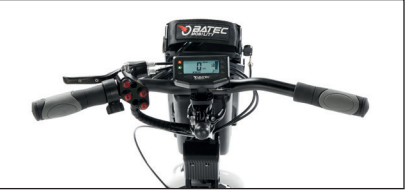
Handlebar option with right or left Monolever brakes for hemiplegics.