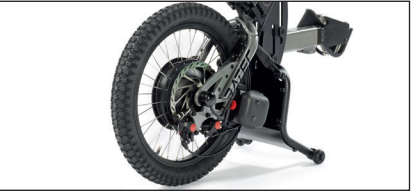
18" Wheel, ultra-grip tyre and aluminium double-wall rim.