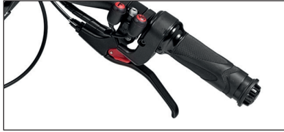
Avid BB5 mechanical brakes, aluminium levers and parking brake.