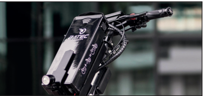
Autonomy of 22 km * with a 36v - 280 Wh battery. Autonomy of 40 km * with a 36v - 522 Wh battery. 4A Charger.