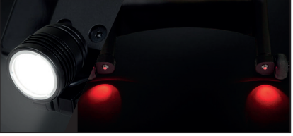
700-lumen front light with position lights / high beam options. Dual LED tail light on the stand frame.