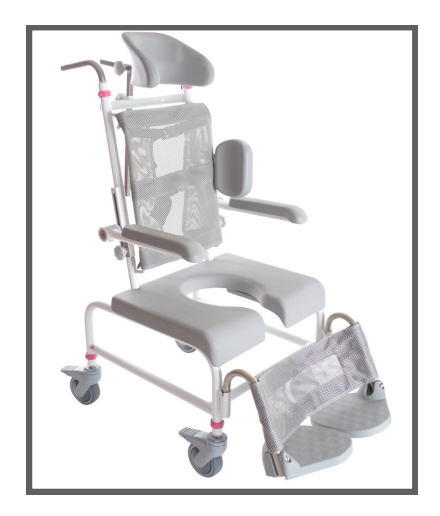
M2 Mini Standard

The M2 Mini models are flexible shower / toilet chairs they can easily be adjusted as the child grows.