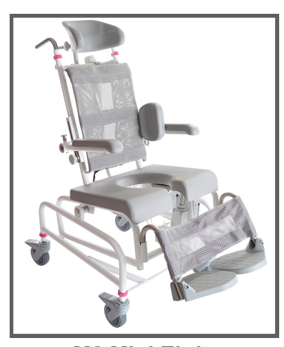
M2 Mini El-tip