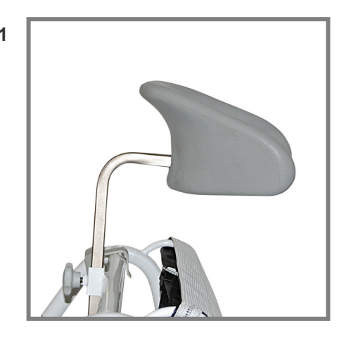
Head support in PU foam Ordinary, art. no.: 310221

The first model is height adjustable and the second and third are height-, depth- and angle adjustable.