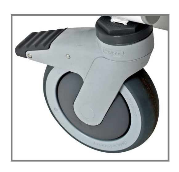
Supplement for the chair comes with 1 direction fixed wheel; Art. no.: 800157

This facilitates maneuvering, and initiation of the chair and ensure that carers' health and safety are protected.