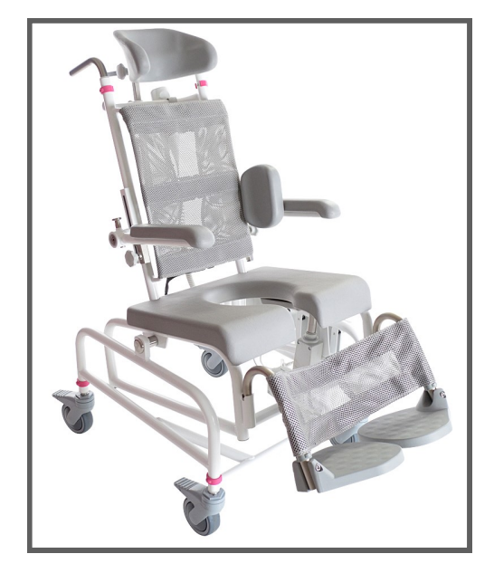
Notice: The chair in the picture is shown with accessories

M2 shower / commode for children and small adults who are difficult to place in a standard chair.