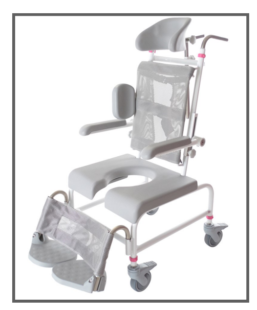
Notice: The chair in the picture is shown with accessories.

Many of the parts on the chair can be adjusted as the child grows, so that it can be a stable support in the everyday user for many years.