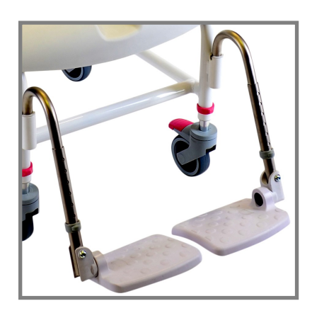
Height adjustable footrests Art. no.: 313041

They are available in a mini version (31-41) cm from the edge of the seat to the base plate) & a standard. (39-51).