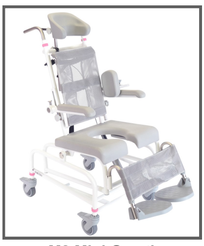
M2 Mini Gas-tip