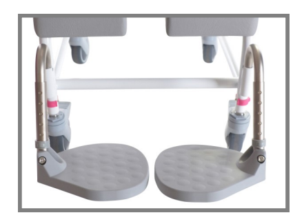
Footrests to Mini Art. no.: 310510

Standard footrests to M2 Art. no.: 310049