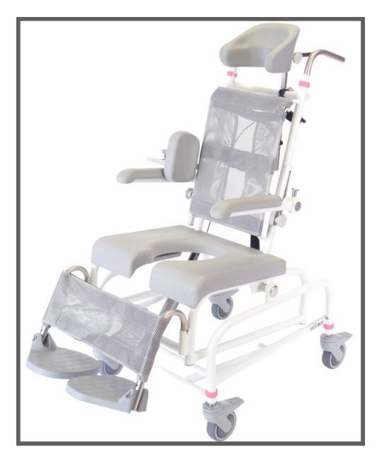
Notice: The chair in the picture is shown with accessories

These armsrests are only supplied with PU foam.