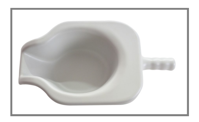
Bucket, intimate to Mini Art. no.: 310516

It is possible to change the length at two steps on the armrests, so the support can be adapted for each user.