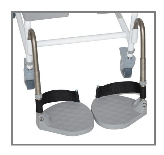
Footrests with heel straps Art. no.: 310285

With heel straps the footrests can still be pushed aside.