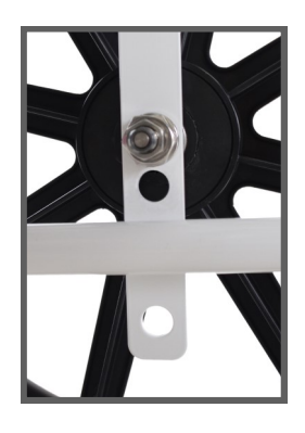
Notice: The chair in the picture is shown with accessories

The chair is height adjustable in 3 positions.