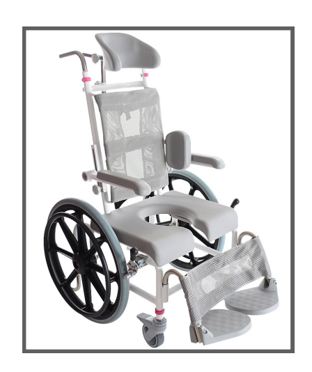
M2 Mini 20" Rear wheel