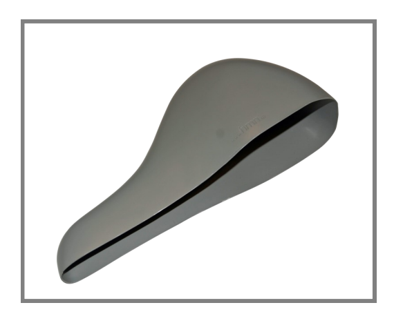
Urine funnel Art. no.: 148861

The urin funnel is used by placing the narrow end facing down towards the toilet, or as to help prevent the person from urinating on the floor or on the toilet seat.