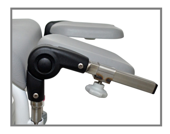
Amputation support right, Art. no.: 800343 Amputation support left, Art. no. 800344