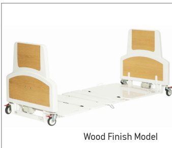
Wood Finish Model