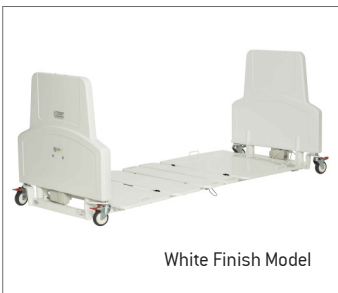
White Finish Model