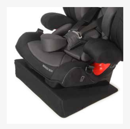
The seat wedge inside and below provide a relaxed resting position during the journey.