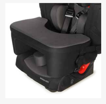
The table is a support surface and an additional impact shield that also prevents the child from attempting to unbuckle the 5-point positioning harness.