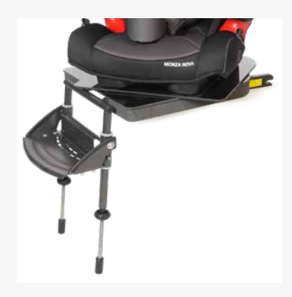
The practical padded swivel base, the Seatfix connection for ISOFIX and the footrest give additional stability.