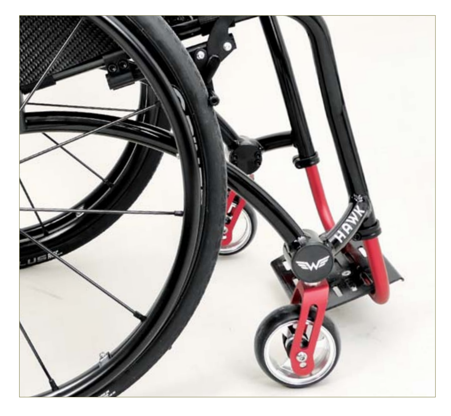
ALL INFORMATION ABOUT THE HAWK ARE ALSO AVAILABLE ON WOLTURNUS.COM