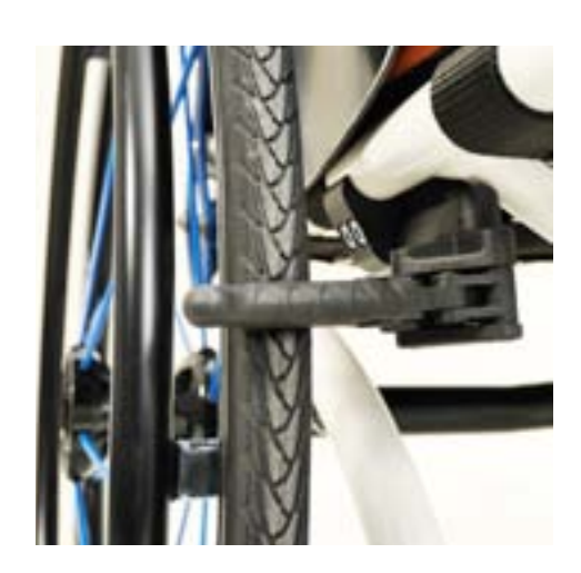
> FIBER PLASTIC WHEEL LOCKS Ultralight scissor wheel locks, for avoiding additional weight