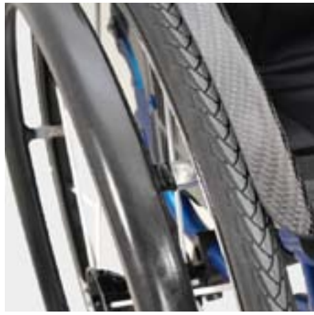
CURVE PUSHRIM Special pushrims, with ergonomically optimized profile