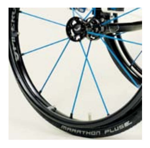
SPINERGY REAR WHEELS Spinergy wheels with spokes in your favorite