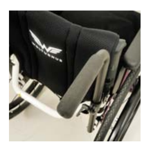
> ADJUSTABLE PUSH HANDLES > WING BACK ILSA A specially designed, patent pending, multi-Heightadjustable push handles with rubber adjustable back rest system for individual coating