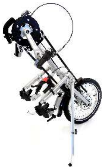
CITY KID CE