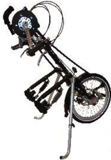
CITY COMPACT CE