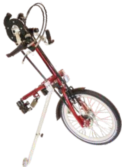
CITY YOUTH CE