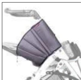
Padded frame covers