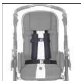
4-point immo. belt