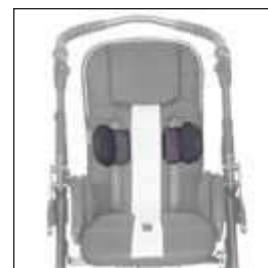
Side trunk rest