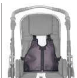
Immo. Waistcoat CLASSIC