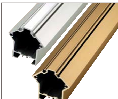
Straight rail available in silver or bronze

On straight stairs, the Solus runs along a strong rail with a slim line design and is fitted to the stairs, not to the wall, so installation is quick and clean. Straight rails are available in either silver or bronze.