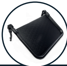
ANGLE ADJUSTABLE THERAPEUTIC TABLE