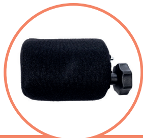
ADJUSTABLE ABDUCTOR (WEDGE)