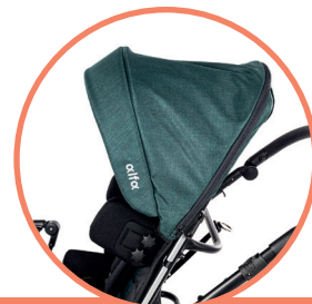
CANOPY WITH WINDOW