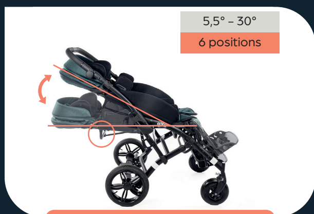
TILT IN SPACE SEAT

In case of any contraindications to sitting position &/or passive verticalization stroller adjustments should be consulted with physiotherapist or physician-in-charge.