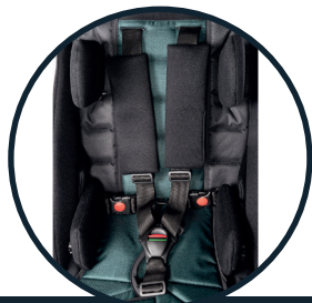
ADJUSTABLE LATERAL AND PELVIC PADS