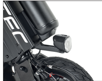
30 Lux front light.