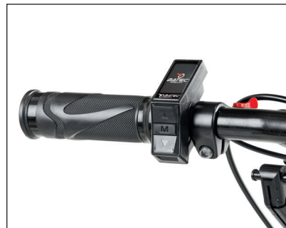
TFT colour display, LED lights and buttons.