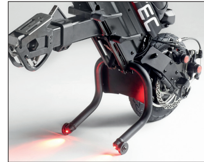
Protective kickstand with wheels and dual rear safety lights.