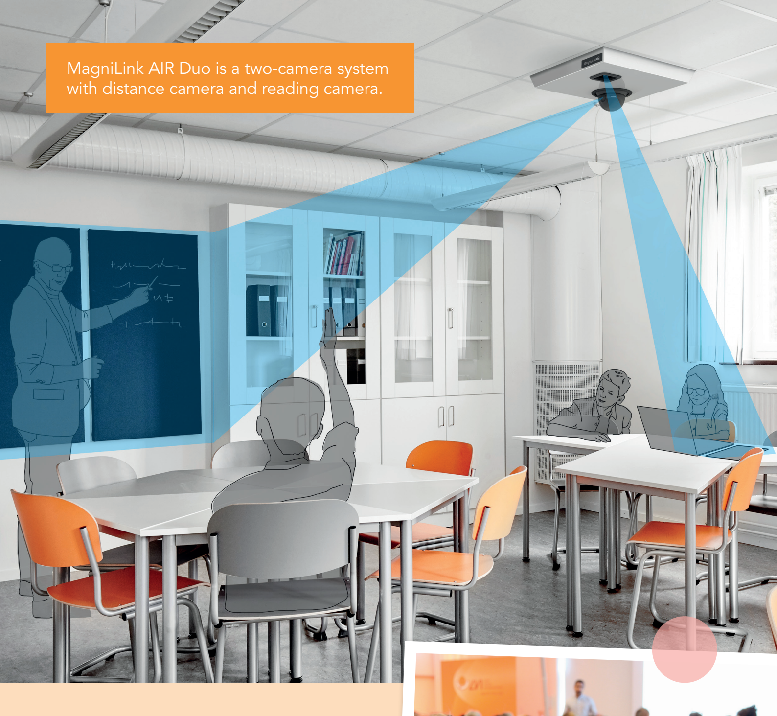
image is then transferred wirelessly from the ceiling-mounted camera to the control unit, which is connected to a separate monitor that shows the image from the camera. A Control box is included, but you can also choose to control the software by a keyboard and a computer mouse.